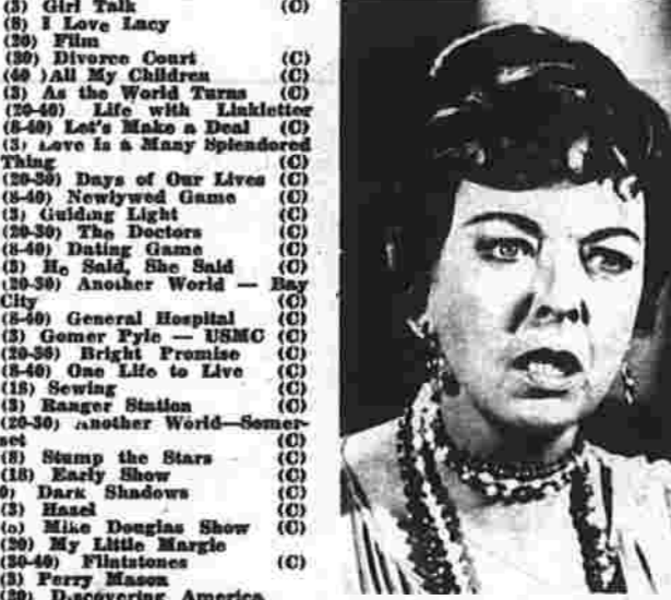
Ida Lupino in NBC's "The Virginian" Wednesday 7:30-9 p.m.

Wednesday, May 27 1:00 (3) Girl Talk (C) (3) Love Lucy (C) (3) Film (C)