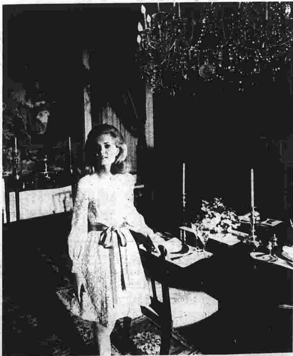
Tricia Nixon gives a tour of the White House Tuesday 10-11 p.m. on CBS.