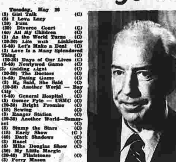
Lloyd Nolan in NBC's "Julia" Tuesday 8:30-9 p.m.

Tuesday, May 26 1:00 (3) Girl Talk (C) (3) Love Lucy (C) (3) Film (C)