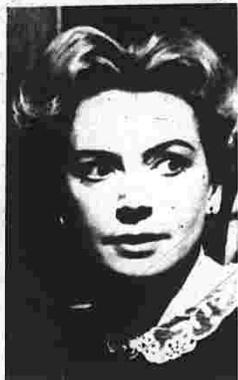
Deborah Kerr in the film, "The Turn of the Screw," Thursday 9-11 p.m. on CBS.

Thursday, May 23 1:00 (3) Girl Talk (C) (8) I Love Lucy (C) (20) Film (30) Divorce Court (C) (40) All My Children (C) 1:30 (3) As the World Turns (C) (30-35) Life with Elizabeth (C) (3-45) Let's Make a Deal (C) 2:00 (3) Love is a Many Splendored Thing (C) (30-35) Days of Our Lives (C) (5-45) Newlywed Game (C) 2:30 (3) Guiding Light (C) (30-35) The Doctors (C) (5-45) Dating Game (C) 3:00 (3) He Said She Said (C) (30-35) Another World — Bay City (C) (5-45) General Hospital (C) 3:30 (3) Gomer Pyle — USMC (C) (30-35) Bright Promise (C) (5-45) One Life to Live (C) 3:50 (15) Sewing (C) 4:00 (3) Ranger Station (C) (30-35) Another World — Somerset (C) (8) Stump the Stars (C) (15) Early Show (C) (40) Dark Shadows (C) 4:30 (3) Hazel (C) (15) Mike Douglas Show (C) (30) My Little Margie (C) (30-45) Flintstones (C) 5:00 (3) Perry Mason (C) (20) This Is the Life (C) (30) Munsters (C) (40) F Troop (C) 5:25 (40) Weather Watch (C) 5:30 (20) US Navy Film (C) (30) Gilligan's Island (C) (40) Truth or Consequences (C) 6:00 (5-8) Weather — Sports and News (C) (15) Leave It to Beaver (C) (20) Sports show (C) (30) McHale's Navy (C) (40) News (C) 6:05 (40) 77 Sunset Strip (C) 6:30 (3) News with Walter Cronkite (C) (8) News with Frank Reynolds (C) (15) Dick Van Dyke (C) (20) Canadian Travel Film (C) (30) Huntley-Brinkley Report (C) (40) Animal World (C) 6:45 (20) Local News (C) 7:00 (3) Golden Voyage (C) (Switzerland, the First-Time Journey)