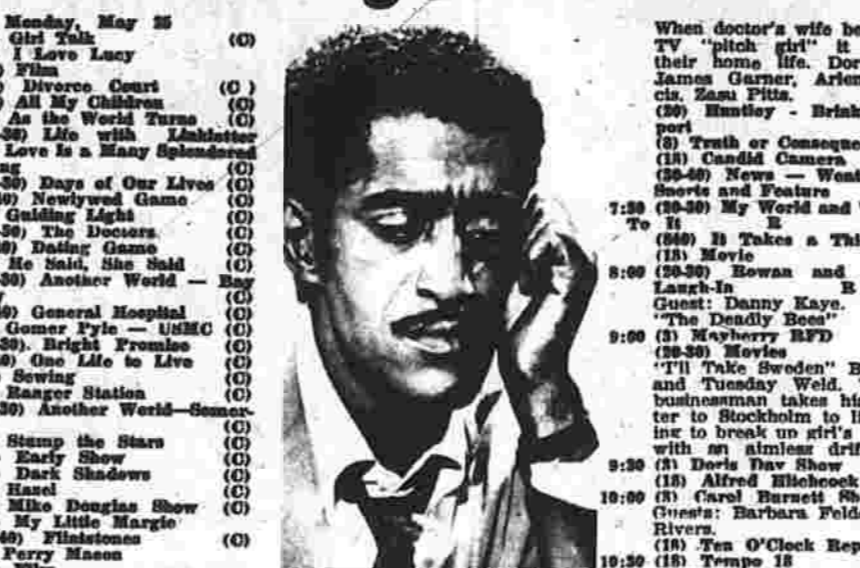
Sammy Davis Jr. stars in the film, "The Pigeon," Tuesday 8:30-11:00 p.m. on NBC.

Monday, May 25 11:00 (3) Girl Talk (C) (3) Love Lucy (C) (3) Film (C)