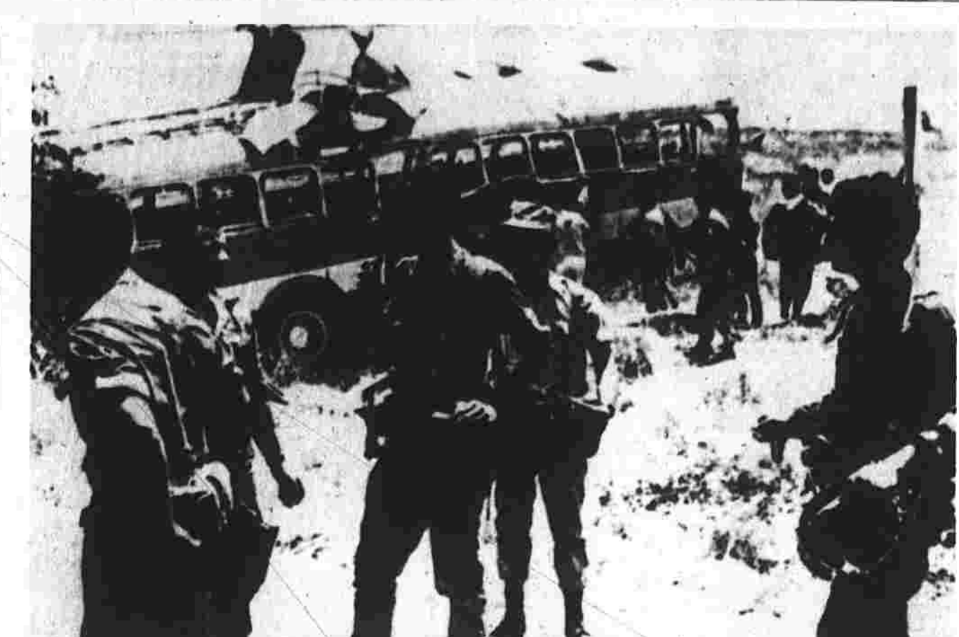
Israeli soldiers check Israeli-Lebanese border area where a school bus was ambushed Friday. Eight children and three adults were killed and 120 others injured by the guerrillas. The Israeli military command announced that Arabs had fired bazookas and small arms about 15 feet from the bus as it headed for a school. The attack has been condemned by many nations. (AP Photofax)

HARTFORD, Conn. (AP) — Police were searching early today for three escaped prisoners who knocked open the back door of a police patrol wagon Friday near Bellevue Square and fled.