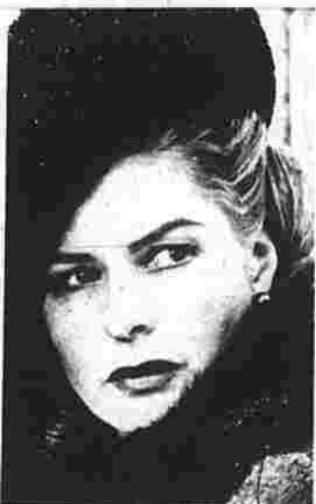
Ingrid Bergman is in the film, "The Visit," Friday 9-11 p.m. on CBS.

rix. (40) News Headlines — USAF Religious Film and Sign Off 1:15 (8) NewsScope (C) 3:30 (3) News and Weather — Moment of Meditation and Sign Off