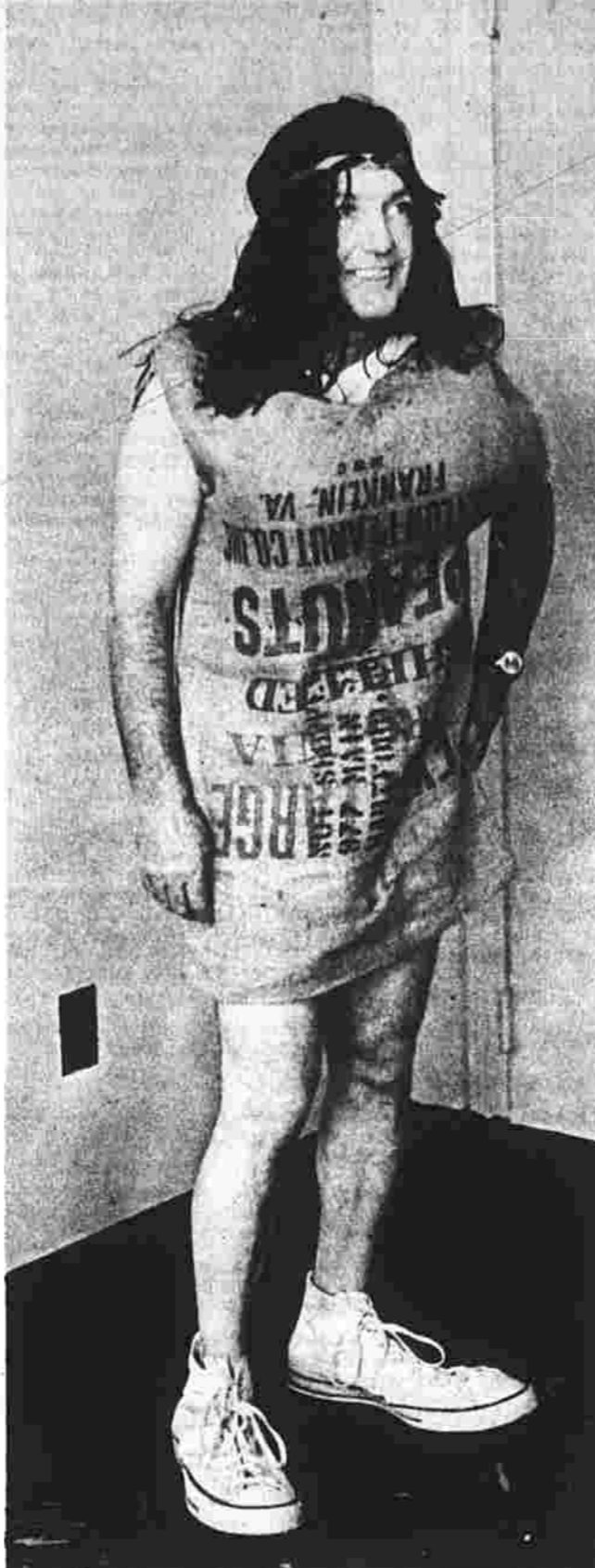
'This is normally not my bag,' apologized your friendly weekly columnist in opening the Senior Citizens' Wednesday fashion show.

Whhew! And still more to tell. We had one of the finest fashion shows you'd want to see, and some real outstanding costumes. Like I said, it was from