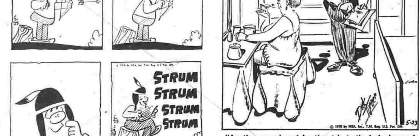
STRUM STRUM STRUM