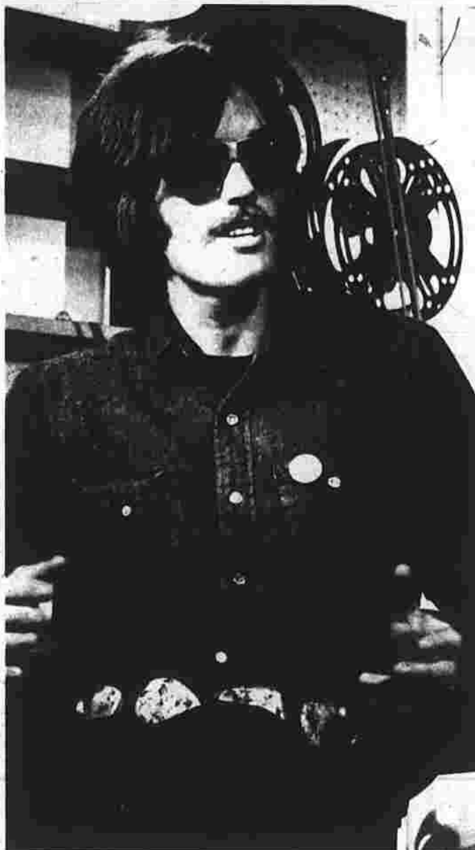
Peter Fonda, who stars in "Easy Rider," narrates NBC's "The New Communicators" Friday, 10 p.m.